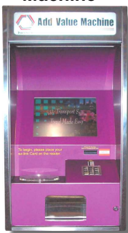
Add Value Machine