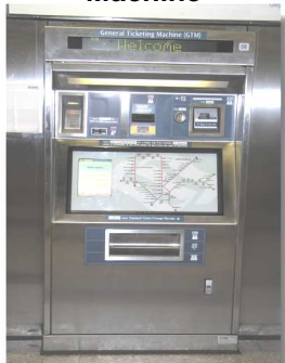
General Ticketing Machine